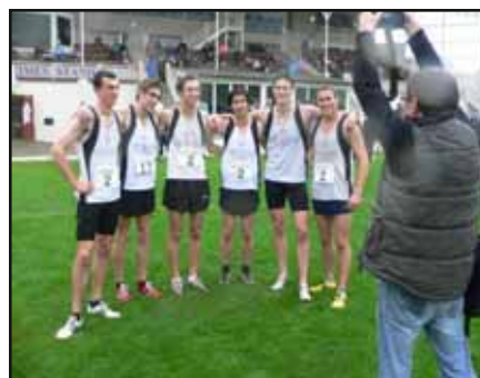
Winning Lovelock Relay Team